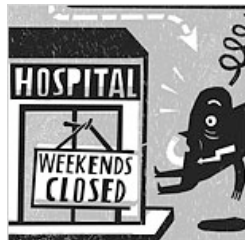
Orszag: Health Care's Lost Weekend