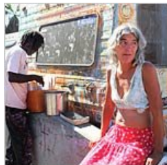
When Home Has No Place to Park