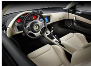
Lotus added luxury touches to the cabin, but some of them come up short. More Photos >

The English automaker made its reputation with slenderized sporting cars, from Formula One racers to street machines. Unprompted, car aficionados can recite the engineering ethos of the company's founder, Colin Chapman: "Simplify, then add lightness."