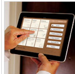
2 Brothers Await Broad Use of Medical E-Records